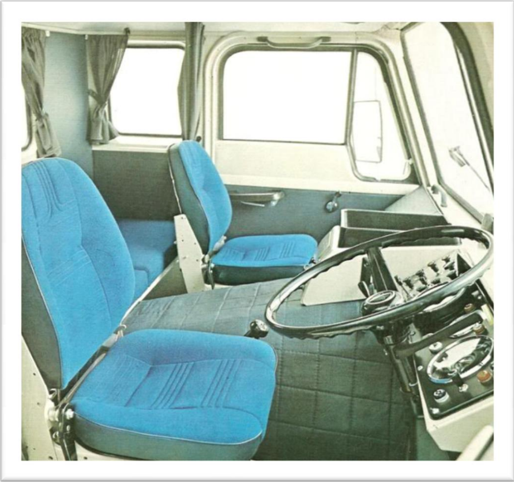
Volvo cabin Interieur / F88, F89